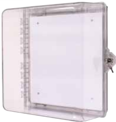
STI-7530 with Key Lock