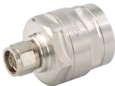
114EZNM Type N Male EZfit® for 1-1/4 in FXL1480 and AVA6-50 cable