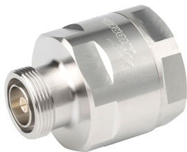
AL6DF-PSA 7-16 DIN Female Positive Stop™ for 1-1/4 in AVA6-50 cable