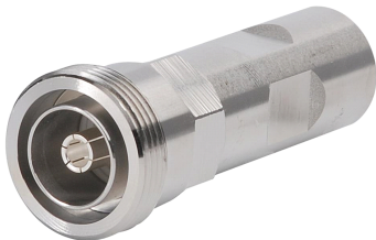
L4TDF-PSA 7-16 DIN Female Positive Stop™ for 1/2 in AL4RPV-50, LDF4-50A, HL4RPV-50 cable