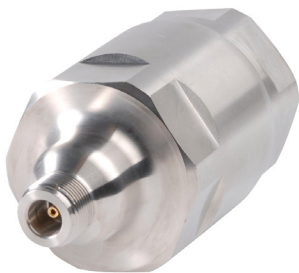
L6PNF-RPC Type N Female OnePiece™ for 1-1/4 in LDF6-50 cable