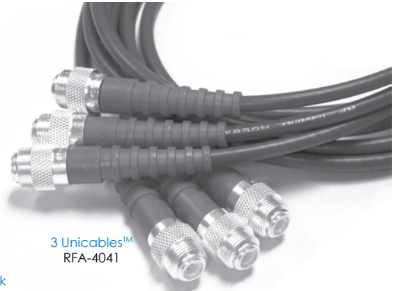
3 Unicable™ RFA-4041