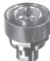
7/16 DIN MALE PT-4000-119