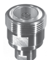
7/16 DIN FEMALE PT-4000-120