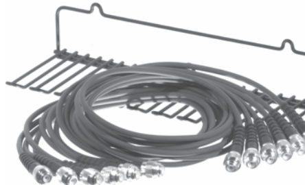
6 piece Unicable™ Kit with rack RFA-4040